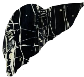
Artwork by Leonie Robison 2023

We participated in February's Rare Disease Month and Rare Disease Day (28 February), dates when all rare disease groups unite to raise awareness about rare diseases.