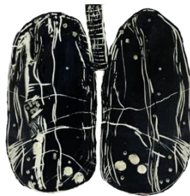
Artwork by Leonie Robison 2023

Our advocacy work continues with the aim to raise awareness of the need for subsidised augmentation treatment in Australia for lung-affected individuals who have the severe forms of Alpha-1 and are severely deficient in the essential protein 'antitrypsin'. We wrote to government representatives raising flaws with the Medical Services Advisory Committee (MSAC) recommendation from the November 2018 and the benefits of antitrypsin infusions. Sadly, the government has not changed its position, citing level of evidence and treatment cost. We, therefore, promote the Grifols Private Purchase Pathway as an option to access privately purchased augmentation therapy.